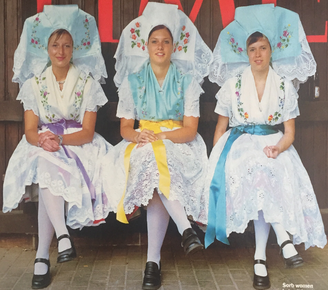
Sorb women in traditional dress in Werben, eastern Germany