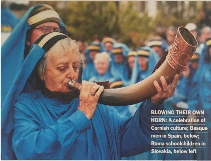
BLOWING THEIR OWN HORN: A celebration of Cornish culture; Basque men in Spain, below; Roma schoolchildren in Slovakia, below left

Not all minorities have been successful in making their identities marketable or politically viable. Of Slovakia’s 800,000