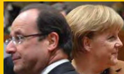
French President Francois Hollande and German Chancellor Angela Merkel at the failed European Union budget talks

WORLD VIEW P.12 Redrawing the borders: The world’s newest countries