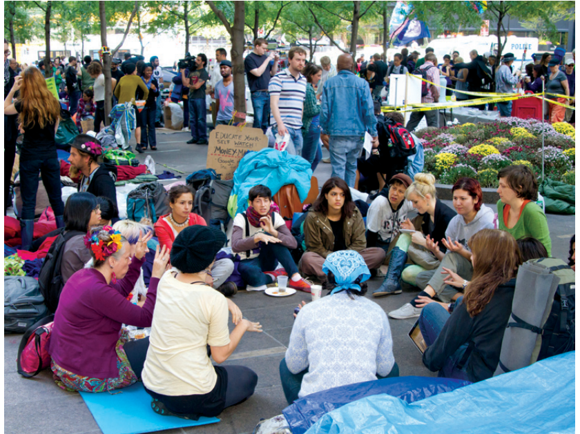
THE OCCUPY MOVEMENT, HERE AT ZUCCOTTI PARK IN NEW YORK, HAS SPREAD INTERNATIONALLY WITHOUT A LEADER.

IRA CHALEFF, AUTHOR OF THE COURAGEOUS FOLLOWER