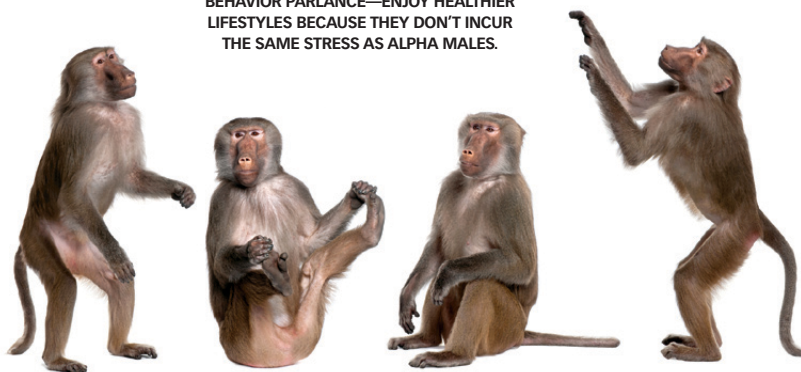
RESEARCHERS STUDYING BABOON TROOPS IN KENYA CONCLUDED THAT ACTIVE FOLLOWERS—THE BETA MALES, IN ANIMAL BEHAVIOR PARLANCE—ENJOY HEALTHIER LIFESTYLES BECAUSE THEY DON’T INCUR THE SAME STRESS AS ALPHA MALES.