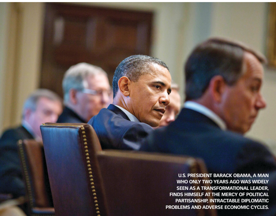
U.S. PRESIDENT BARACK OBAMA, A MAN WHO ONLY TWO YEARS AGO WAS WIDELY SEEN AS A TRANSFORMATIONAL LEADER, FINDS HIMSELF AT THE MERCY OF POLITICAL PARTISANSHIP, INTRACTABLE DIPLOMATIC PROBLEMS AND ADVERSE ECONOMIC CYCLES.