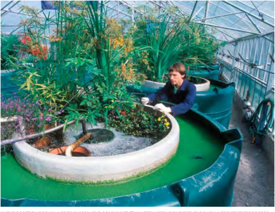
IN THE SCOTTISH ECOVILLAGE FINDHORN, THE COMMUNITY'S WASTEWATER IS PURIFIED THROUGH A TREATMENT PROCESS THAT INVOLVES VARIOUS TANKS

and recharge the aquifers. Although the price tag was higher at $100 million, according to their calculations the city would make that extra bit back in 40 years, largely due to the decrease in water that they would have to suck out of the overtaxed Colorado River. Dolman thinks the watershed approach to water management will become increasingly